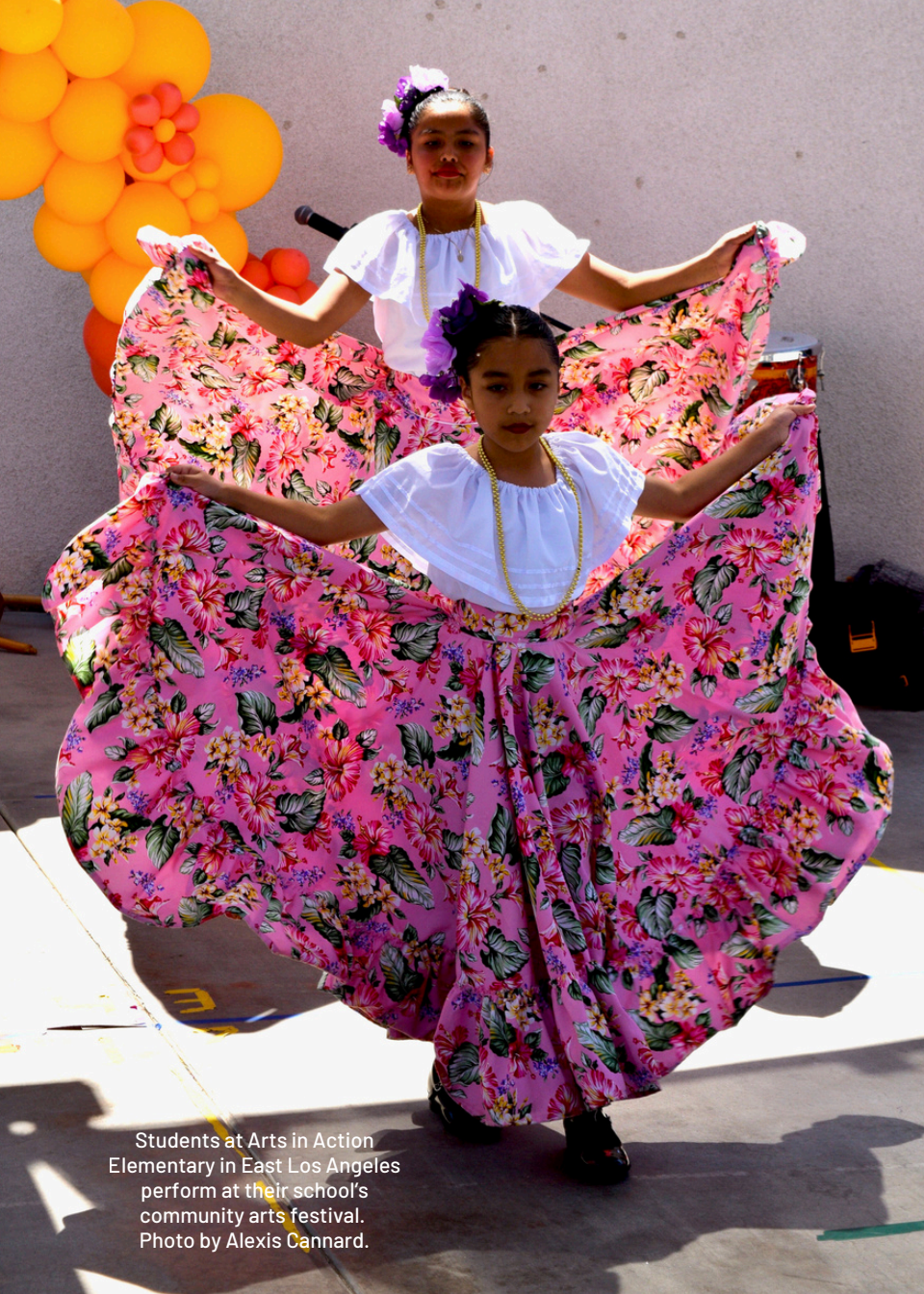
Students at Arts in Action Elementary in East Los Angeles perform at their school's community arts festival.