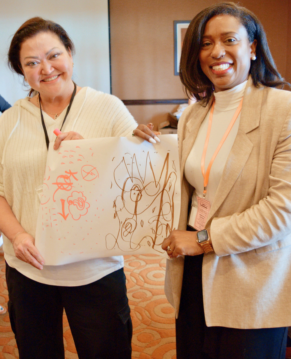
Educators at our 2025 Winter Arts Leadership Retreat.