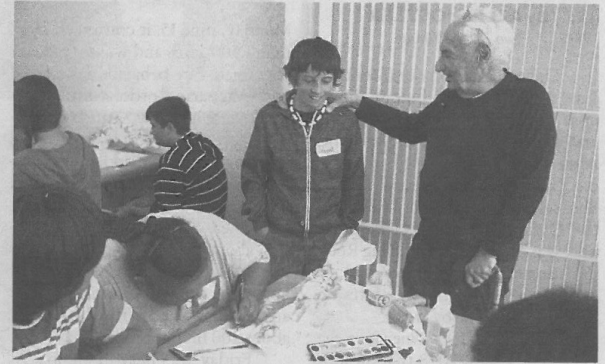
During their trip to Los Angeles, Hoopa Valley Elementary School (HVES) eighth grader students had a chance to reconnect with architect, Frank Gehry. While at Gehry's office, students were given the opportunity to work with the architect and make fish lamps. These lamps will be installed at HVES as a gift from the graduating class. Gehry was first introduced to students during his visit to HVES. HVES was one of ten schools in California to be sponsored by the Turn Around Arts initiative.

The Turn Around Arts California initiative is different than other grant programs. The group gives small amounts of money to bring artists into the community or to sponsor activities such as the eighth