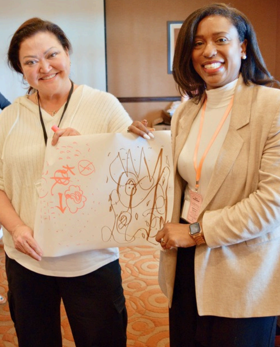
Educators at our 2025 Winter Arts Leadership Retreat.