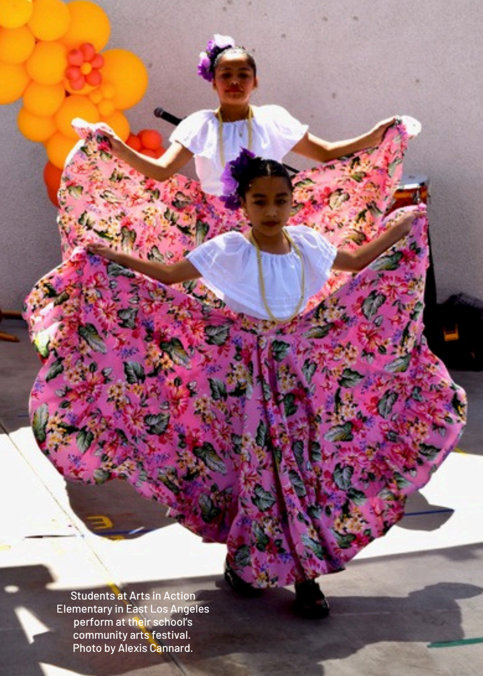
Students at Arts in Action Elementary in East Los Angeles perform at their school's community arts festival.